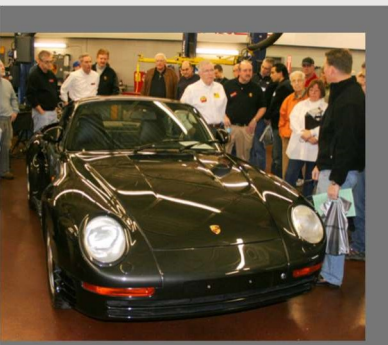
Introduction to making it look Amazing