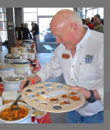
Seasoned experts judge the chili